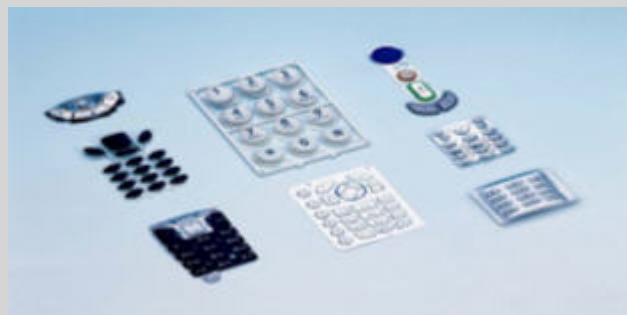
PC Film Keypad / Double Injection Keypad