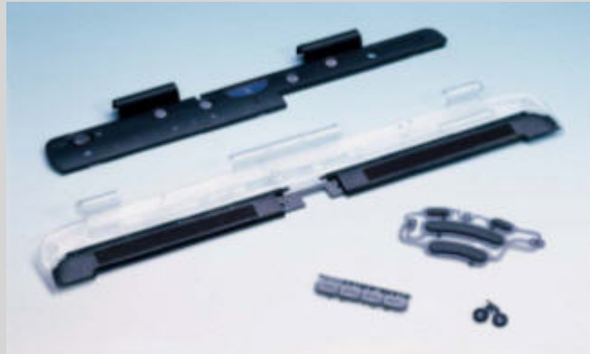
Notebook Double Injection Parts