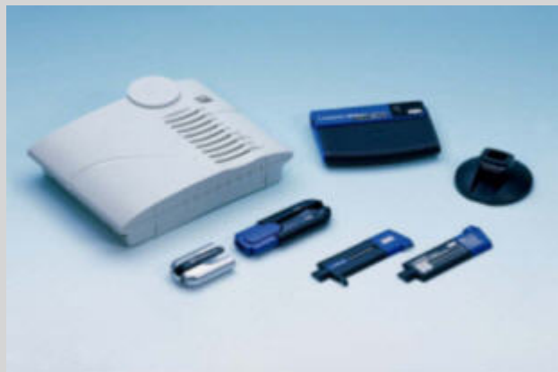
Wireless Network Card Cover

Painting and Printing are also available.